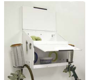
Spray Booth Accessories